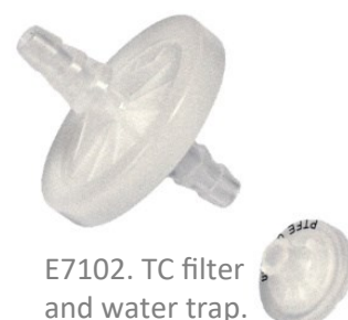
E7102. TC filter and water trap.