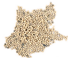
B1724. Special catalyst platinum.