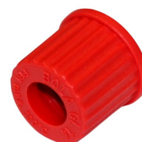
E7142. Screw joint cap. GL14.