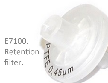
E7100. Retention filter.