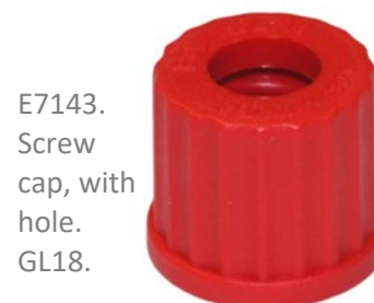
E7143. Screw cap, with hole. GL18.

The use of Analytik Jena® part numbers is intended for convenience only, and does not imply the products are of OEM origin. All Elemental Microanalysis products are guaranteed to be of high quality and are deemed to be suitable alternatives in the stated instruments. All Analytik Jena® trademarks acknowledged.