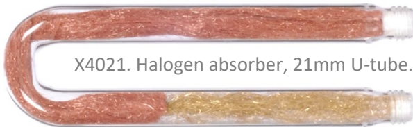
X4021. Halogen absorber, 21mm U-tube.

These U-tubes are supplied pre-filled with brass and copper wool halogen absorbers.