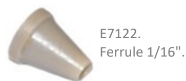
E7122. Ferrule 1/16".