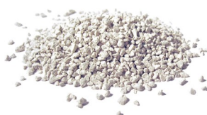
B1731, B1730. Special catalyst N/C.