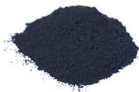
B1725. Activated carbon.

Brass and copper wool, halogen absorbers and magnesium perchlorate drying agent to cerium dioxide and platinum special catalysts, from our ISO 9001 facility Elemental can supply you with the chemical reagents you need for your Analytik Jena analyser.