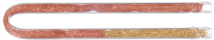
X4020. Halogen absorber, 11mm U-tube.