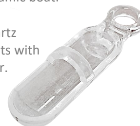
C8135. Quartz sample boats with downholder.