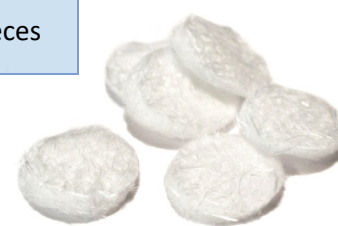
B1257. High temp mat.

The use of Analytik Jena® part numbers is intended for convenience only, and does not imply the products are of OEM origin. All Elemental Microanalysis products are guaranteed to be of high quality and are deemed to be suitable alternatives in the stated instruments. All Analytik Jena® trademarks acknowledged.