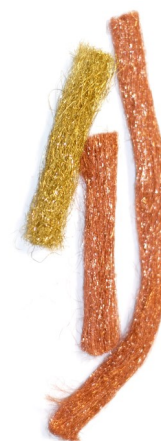
B1720. Halogen absorber filling.